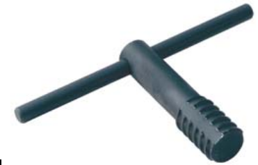
HR-500TC Thread Clean Out Tool

Aids in removing substances from threads, such as dirt, rock and mud, that could restrict proper installation of HR-500 Trench Cover.