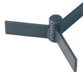
HR-500WF Welding Fixture