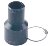
HR-500HG Thread No-Go Gauge