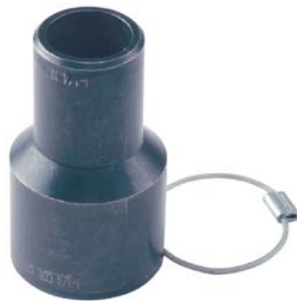
HR-500HG Thread No-Go Gauge

Several “time saving” accessories are available with the HR-500 Trench Cover.