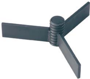
HR-500WF Welding Fixture

Aids in the welding process by ensuring proper alignment of nut onto cover.